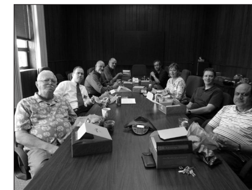
Lunch with the Basic Sciences' Faculty