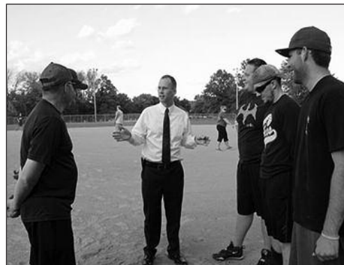
Encouraging players at the Faculty/Student Softball Game