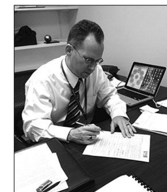
First Week – Paperwork